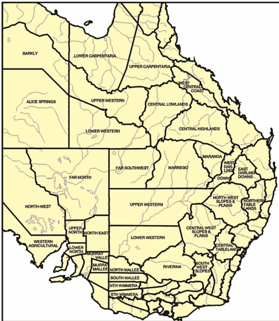
Figure 1. Meteorological districts