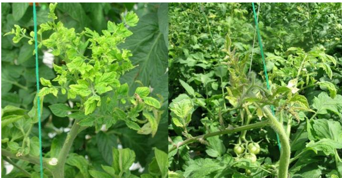
Figure 4.1: Symptoms of psyllid yellows in tomato plants (MAFBNZ 2008)

In tomato, symptoms observed by Liefting et al. (2009) in greenhouse crops included spiky, chlorotic apical growth with purpling of the midveins depending on the cultivar, general mottling of the leaves, curling of the midveins, overall stunting of the plants, and in some cultivars fruit deformation. Fruit may be misshapen, with a strawberry like appearance, and uneven development of fruit locules. In some cases, there is no fruit set at all (Figure 4.1).