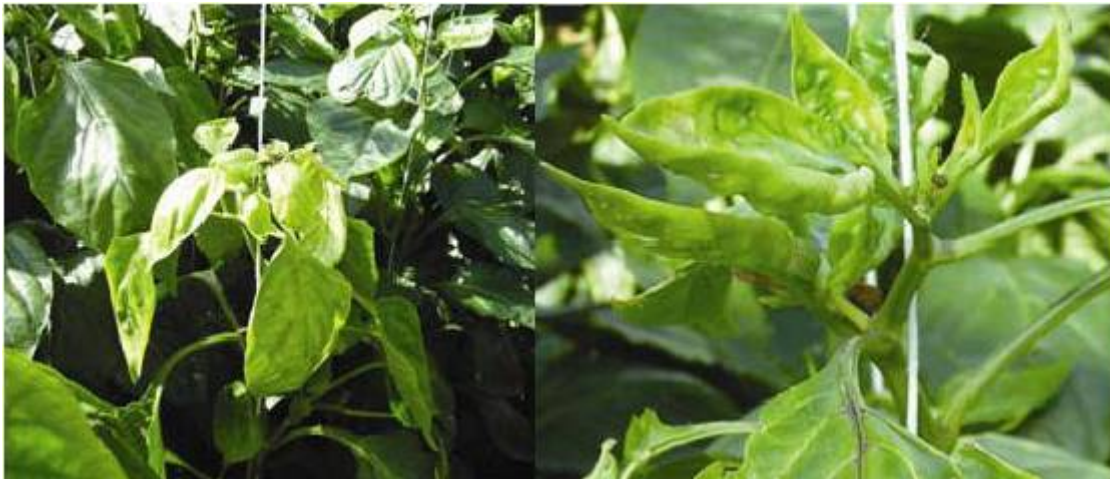
Figure 4.2: Symptoms of psyllid yellows in capsicum plants (Liefting et al. 2009)