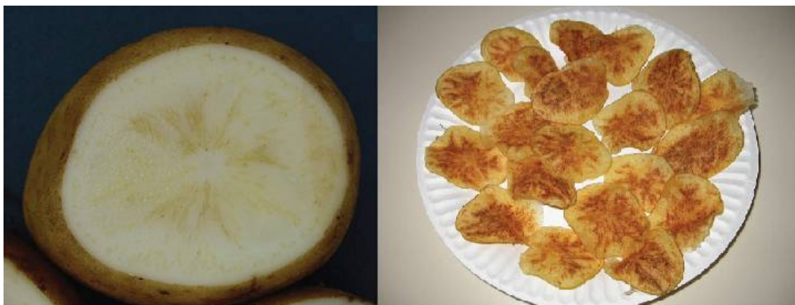
Figure 4.4: Symptoms of zebra chip disease develop when potato chips are fried (Munyaneza et al. 2007)

Zebra chip is the name given to symptoms of psyllid yellows in fried potato chips (Munyaneza et al. 2007). The characteristic symptoms of zebra chip are a striped pattern of discoloration in fried cross-sections of potato tubers (Figure 4.4).