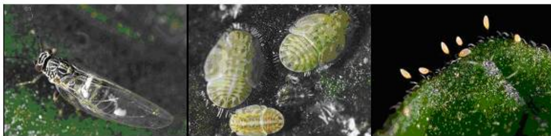
Figure 4.6: Bactericera cockerelli adult, nymphs and eggs (UCIPM 2009)