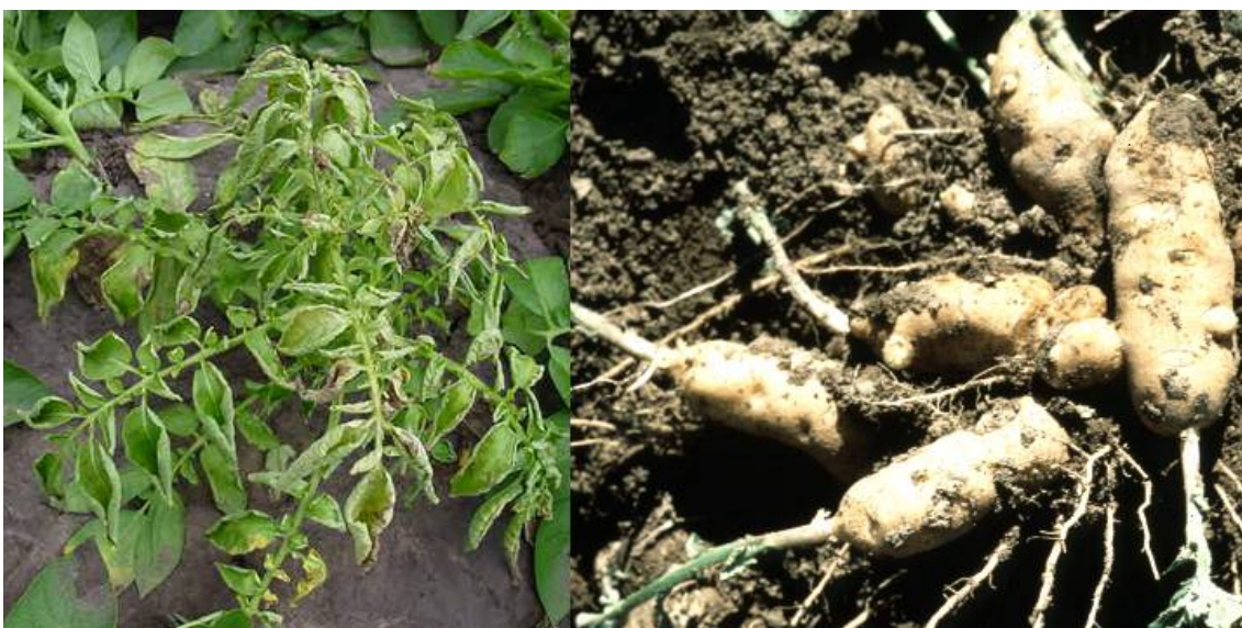
Figure 4.3: Foliar scorching and premature tuber sprouting symptoms of psyllid yellows in potato plants (Secor 2006; Cranshaw 2004)

Leaf scorching and premature sprouting symptoms of psyllid yellows are shown in Figure 4.3.