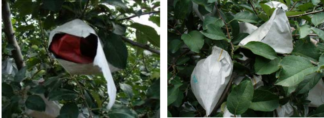
Figure 2: Double bags used for bagging of apple fruit in China (left) and bagged fruit in apple orchard (right).

Harvested apple fruit is washed, waxed, dried, inspected for quality and graded. Bagged fruit may not be washed unless requested by importing countries. Apples are usually maintained under controlled humidity and temperature (e.g. 0–1 °C) conditions. Transportation from the packhouse may occur in refrigerated containers (AQSIQ 2005).