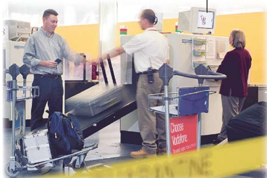
Quarantine officers use x-ray machines to screen for potential risk items in people's luggage. They are looking for any materials made from plants or animals.