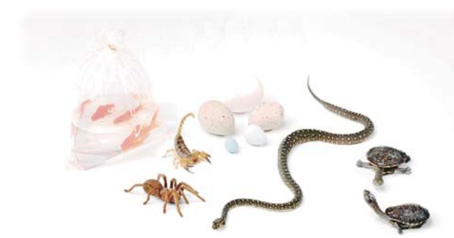
Some people try to sneak live animals into Australia inside clothes or luggage. As well as endangering the animals, this could introduce diseases that could hurt our wildlife, farm animals and pets.