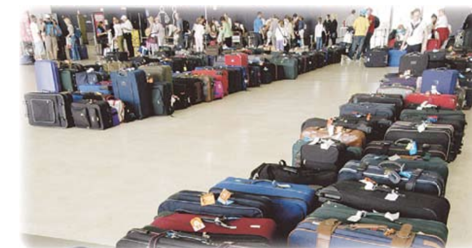
Cruise passengers keep quarantine inspectors busy. Their luggage often contains a large amount of organic material, including woven grass hats, skirts and bags; drums covered in raw (unprocessed) animal skin; and jewellery made from plant seeds.

Organic material is any material that is alive. Quarantine inspectors need to check all organic materials that come into Australia – as well as any items that could harbour organic material (for example wooden artefacts that insects like to eat and live in). A grass skirt, a book covered with banana leaf, a woollen floor rug, a drum covered with raw animal hide, and any sort of food (both raw and processed) are all examples of organic material. Examples of non-organic material include most manufactured goods (other than food), including electronics, goods made from metal or plastic, most clothing and most paper goods.