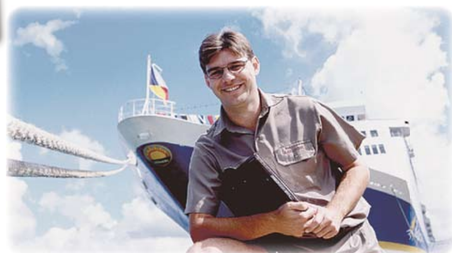
Cruise ships bring about 100,000 passengers to Australia each year, and all their luggage must be screened for any materials harbouring exotic pests or diseases.