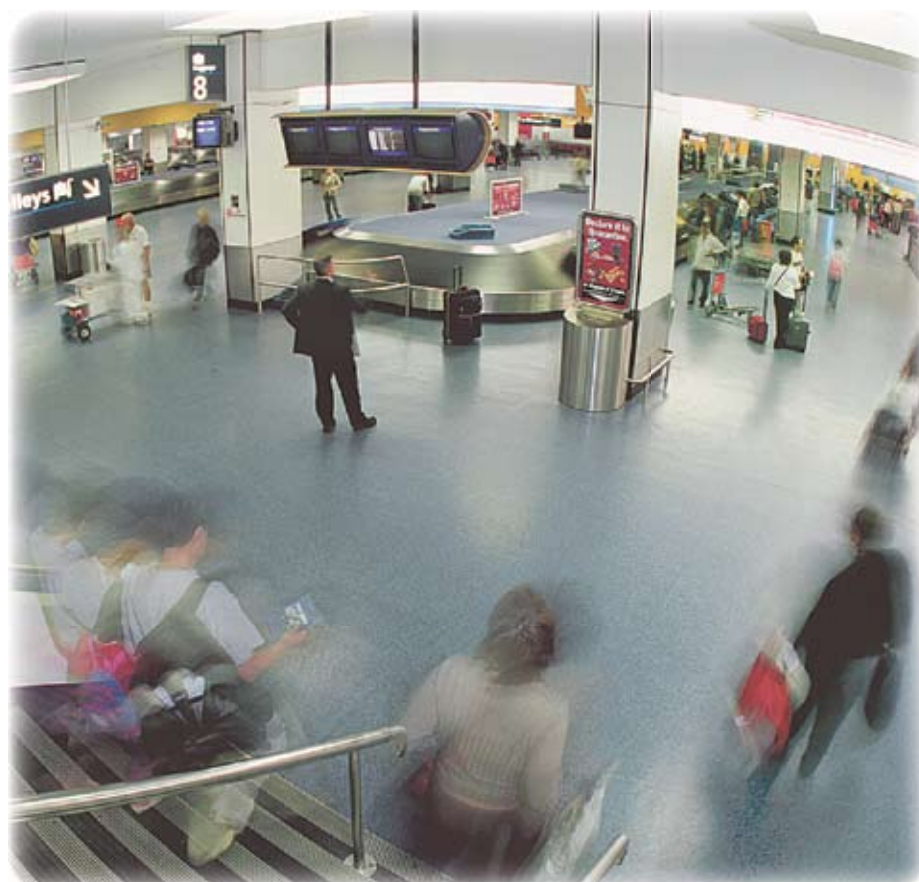
More than 8 million travellers land in Australia each year; each traveller's luggage is screened for items that could bring in pests or disease.

Australians love to travel overseas. We also get millions of overseas tourists visiting each year. This means a huge task for Quarantine.