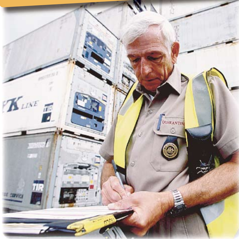
More than a million containers arrive in Australia each year. We need to make sure they are not carrying pests, weeds or diseases.

More than a million containers of cargo arrive in Australia each year from all over the world. Any could potentially introduce an exotic pest, disease or weed.