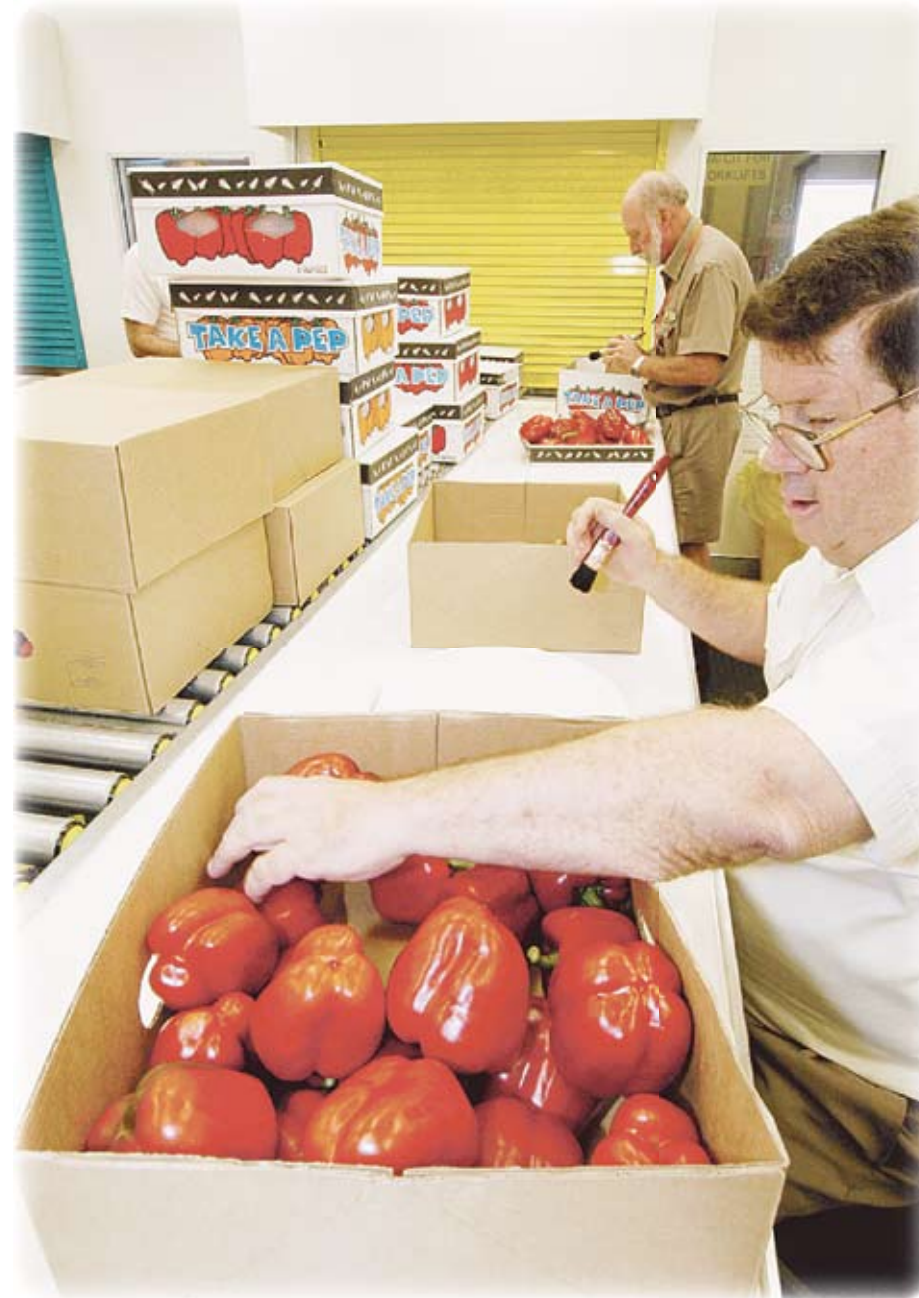
Food imported to Australia is checked to make sure that it's pest free.

Quarantine inspectors need to make sure all imported foods are safe to eat and do not carry any exotic hitch-hikers. This involves checking the list of ingredients on the label as well as chemical testing of some food items. These checks allow us to make sure all food Australia imports meets the same standard as the food grown in our own country.