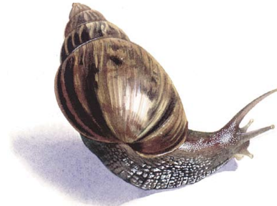
Giant African snail can reach the size of a football, and has an appetite to match its size.

The giant African snail can grow to over 30cm in length, eat over 500 different species of plants and can lay more than a thousand eggs each year! AQIS finds over 30 of these slimy hitchhikers on cargo every year, but fortunately not one has made our country their new home.