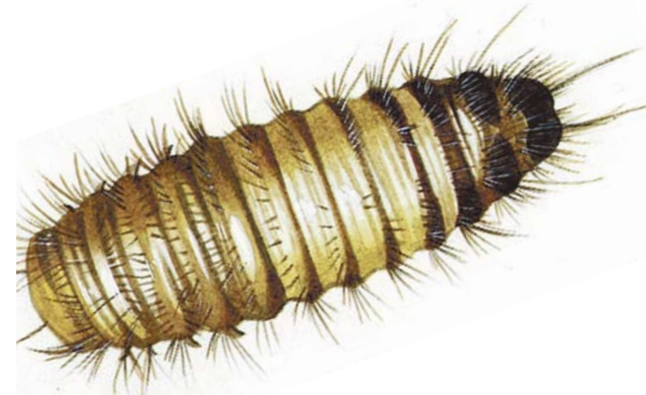
Larvae of the Khapra beetle - a very serious pest of stored grains.

Not quite serial killer, but nearly as bad ... khapra beetles devour stored grains and cereals. From their native home in India the beetles have spread – mostly through shipping and trade – to southern Asia, the Middle East and north Africa. Australia exports billions of dollars worth of grain and plant products each year to more than 50 different countries, and our trade partners will refuse grain that contains pests like the khapra beetle. So this pest is one we definitely don't want.