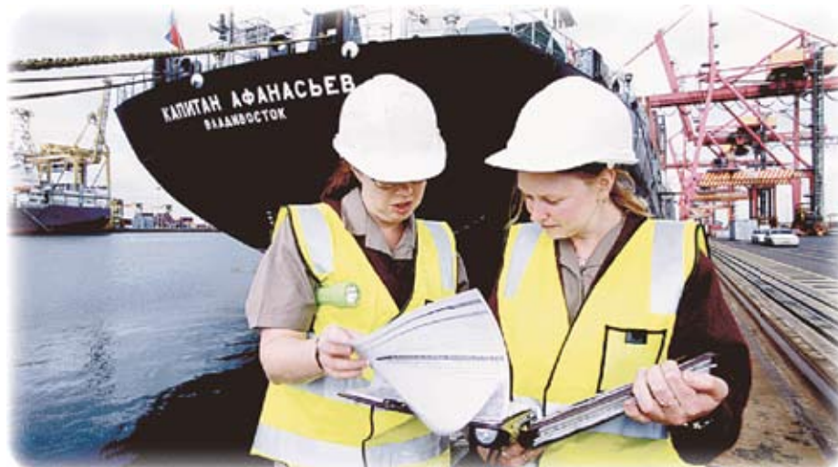
Staff from the Australian Quarantine and Inspection Service check the manifests for a shipment of cargo.

Last year Quarantine officers checked the outside of more than 1.5 million shipping containers. If you stacked these containers side by side, the line would stretch all the way from Canberra to north Queensland.