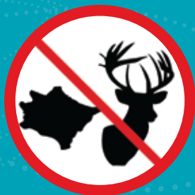
Untreated hides or skins, or other animal products