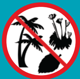
Live plants including cuttings or seedlings, or plant products*