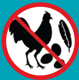
Poultry products including eggs, or feathers with skin attached