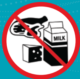
Meat or dairy products (excluding canned items)