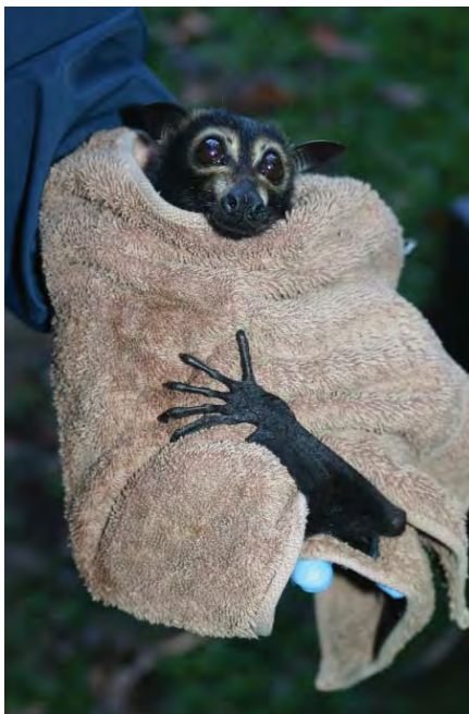
Restraint of an adult Flying Fox using a towel

Lyssavirus infection should be excluded whenever a bat is submitted that has